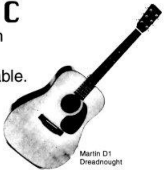
Martin D1 Dreadnought

All price ranges available. Martin • Yamaha Washburn Fender • Ibanez Stop in and play.