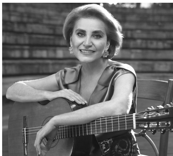
Berta Rojas on February 26