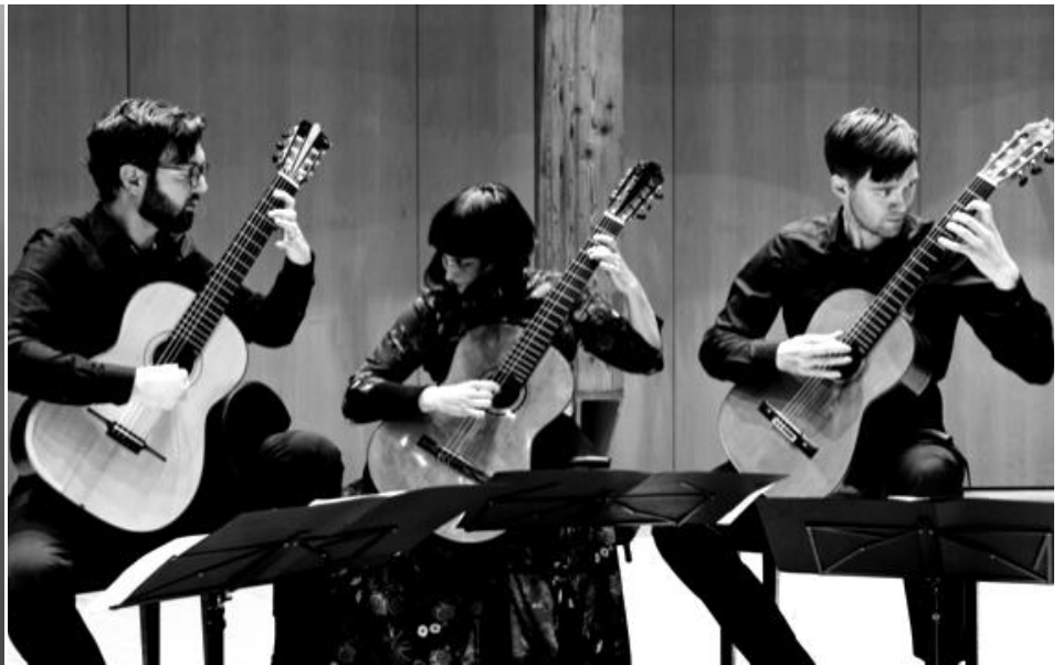
Salzburg Guitar Trio