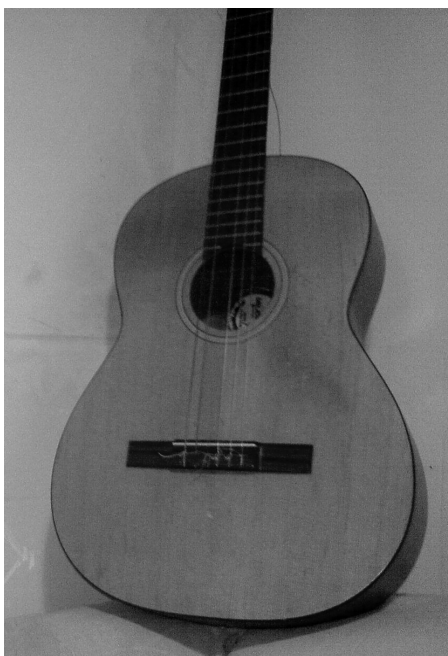
Acoustic Guitarathon Saturday January 23