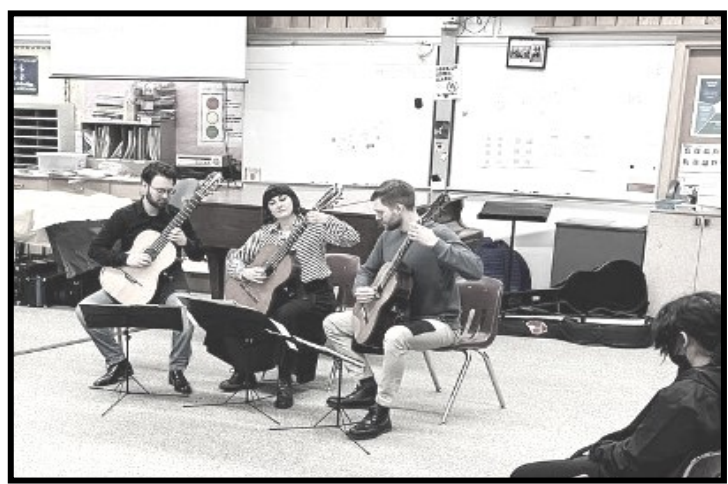
Salzburg Guitar Trio at Harding High School.

The purpose of the Guitars in Our Schools (GIOS) program, now in its fourth year, is to give Twin Cities music students the opportunity to experience extraordinary, live performances by world-class, touring guitarists — and perhaps spark in those students a new passion and creative outlet in the guitar.