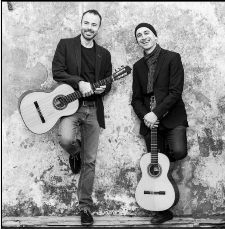
SoloDuo will perform on a Sunday afternoon in February 2024.